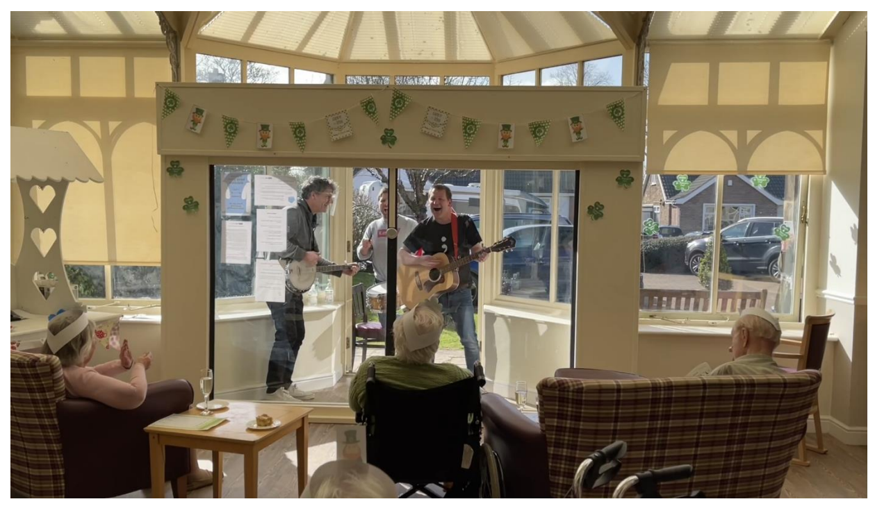
Local Band Wildcats of Kilkenny entertain White House Care home residents from their visiting pod.

and resolving issues with ordering tests. Crucially, the Council worked together with local NHS trust colleagues to enable early access to Covid-19 vaccinations for social care staff – a local vaccine booking system was opened to front-line social care workers who were also priority at our local walk-in vaccination clinics.